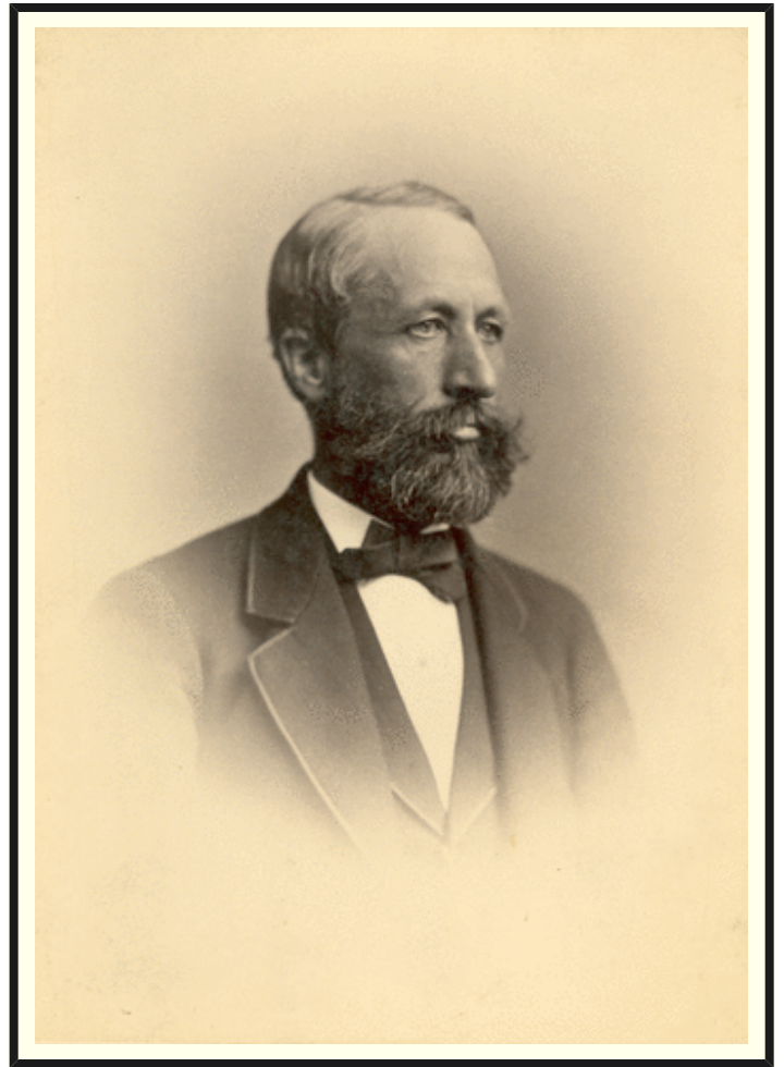
William Smith Clark

teacher, and a fund raiser for the college. His teaching at