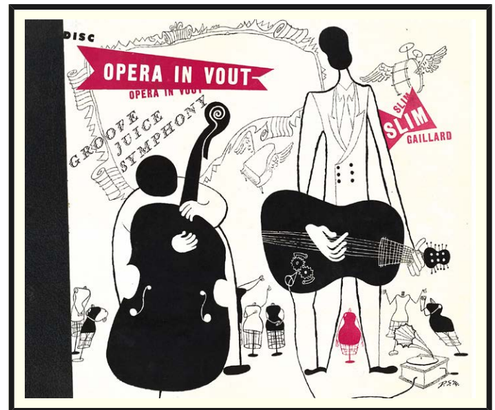
Slim Gaillard and Bam Brown, "Opera in Vout," 1946. Illustration by David Stone Martin.