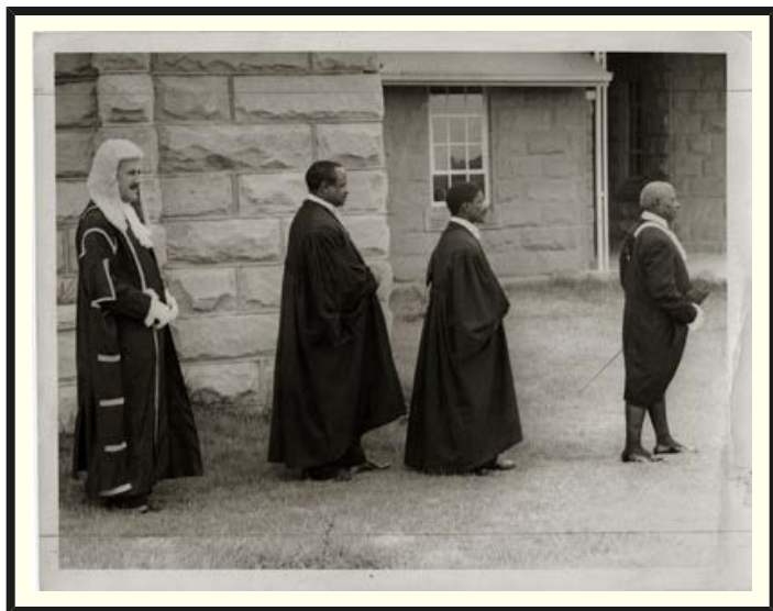
Procession in legal robes, ca. 1976

With the transformation of the African map through independence and the evolution of priorities, the AAI fine-tuned its programs in the 1970s through 1990s, sometimes narrowing its focus on specific regions. The persistence of apartheid in southern Africa and of colonial rule in Lusophone countries absorbed a great deal of the AAI's energy, resulting in the Southern African Training Program (SATP) in 1976, in which trainees from South Africa and Zimbabwe attended the National University of Lesotho, and later programs such as a USAID-funded project on development in Portuguese-speaking Africa and a training program in agriculture in Mozambique. While some program were narrowly focused, others reached out into newly emerging fields of need. In 1990, the Advanced Training for Leadership and Skills Project (ATLAS) became a force in promoting sustainable development, yielding alumni such as Nobel laureate Wangari Maathai, while between 2002 and 2007, the African Technology for Education and Workforce Development (AFTECH) applied information technologies to the need for accelerating workforce development in Africa. The AAI also increased its efforts to address women's issues in Africa, including the 10,000 Women Initiative, a 2008 partnership with the Goldman Sachs Foundation that offered non-degree and business degree training for African women.